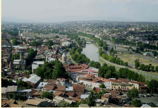
Tbilisi City. View from Narikala Fortress.

Georgian Technical University, 77 Merab Kostava St., Tbilisi, Georgia ( http://gtu.ge/Eng/ )