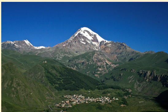
Mt. Kazbek. Military Georgian Road area.