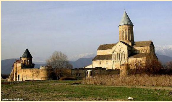
Kakheti region. St. George Cathedral (11 th century) in Alaverdi Monastery established in 6 th century

It is supposed that a field workshop will be held on October 4-5, 2018 in Kakheti region (Telavi and Kvareli) and along the Georgian Military Road (Kazbegi). Workshop will include two one-day trips, with the return to Tbilisi in the evening.