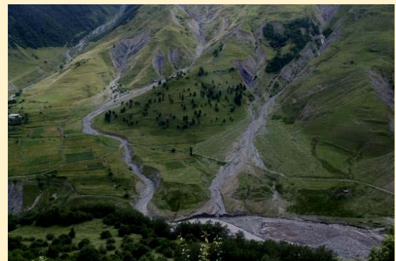
Debris flow catchments near Kvemo-Mleti village