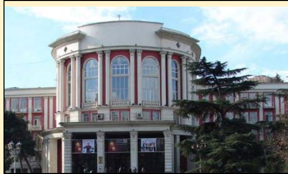
Georgian Technical University. Building No. 1