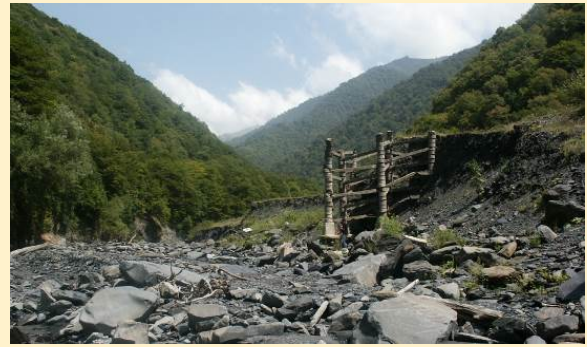
Protective dam destroyed by debris flows. Duruji River upstream of Kvareli town